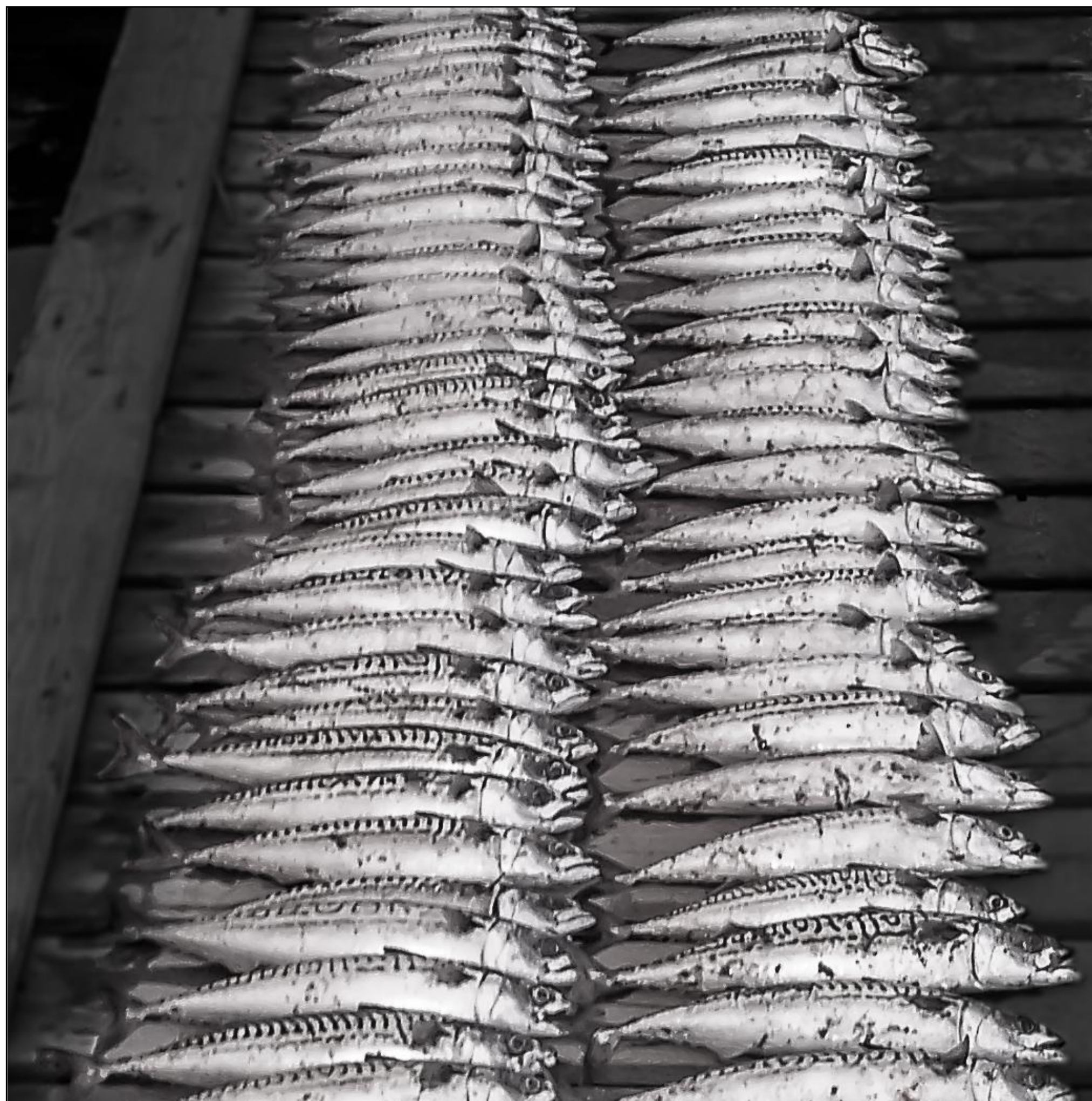
Figure 1. Mackerel caught by locals in Svalbard in the middle of September 2013.